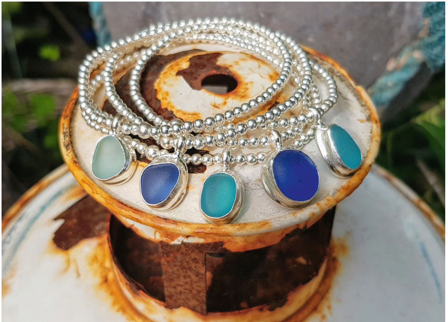
Pirates' desire: sea-treasure stretch silver bracelets ( above ) and sterling-silver ring ( below ), softly luminous after years amid the waves