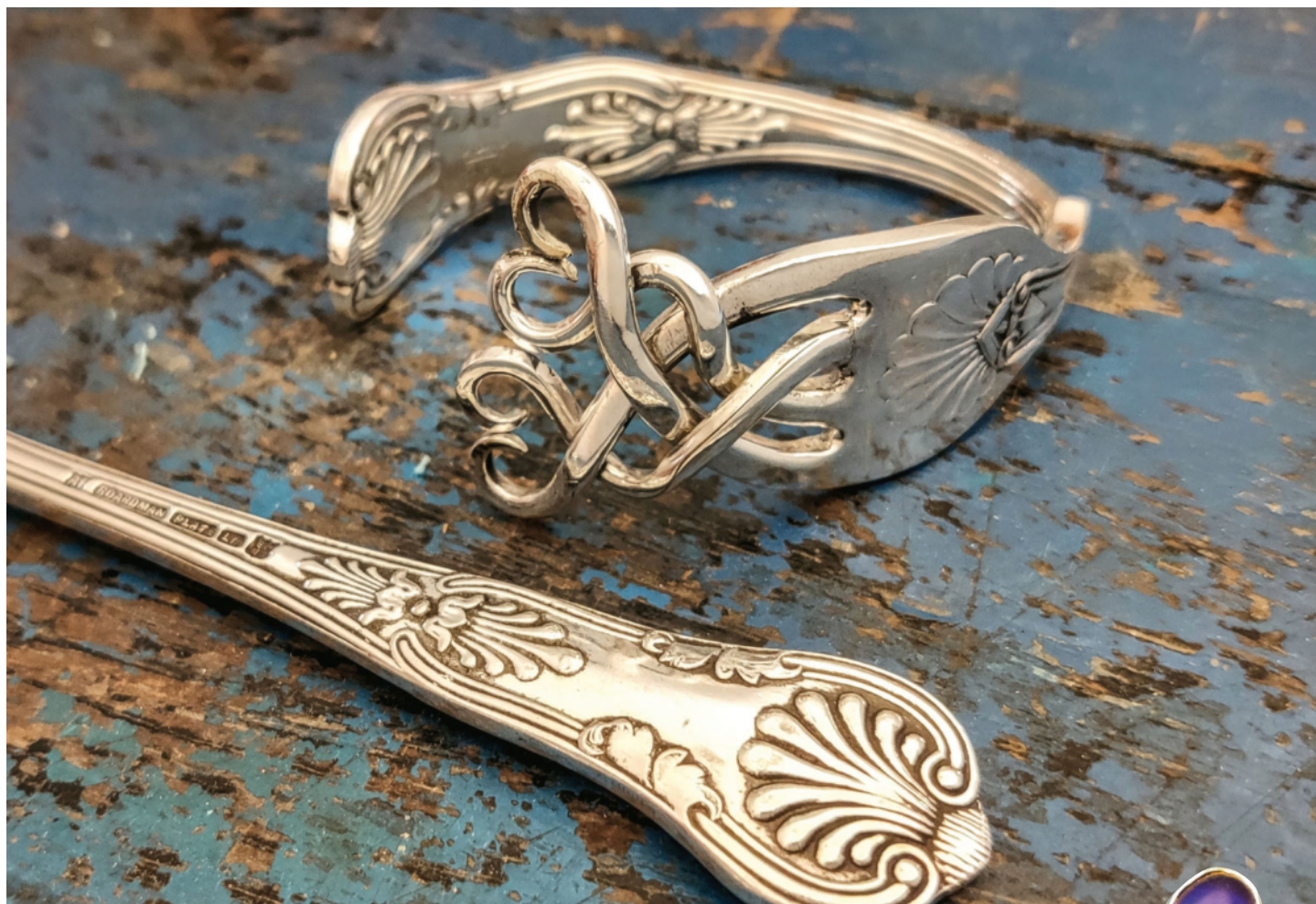
Left: A joy forever: a vintage watch becomes a pendant. Above: Elegance retained: two-hearts-entwined fork bracelet. Right: Ring set with sea glass. Below: The Somme Poppy, made from Armed Forces metals