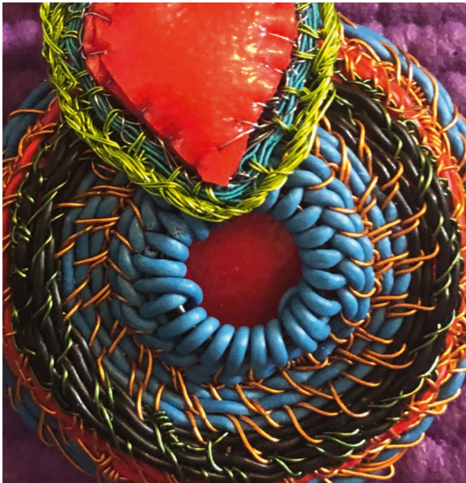
Above: Kandinsky-inspired circular brooch and heart necklace, created from repurposed plastic. Below: Porcelain buttons become cufflinks, with links from an old necklace. Right: Lapel imagination: a curb bracelet attached to a bloodstone pocket-chain fob